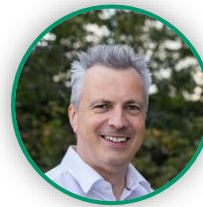
Matt PAYNE ROLLS ROYCE COO